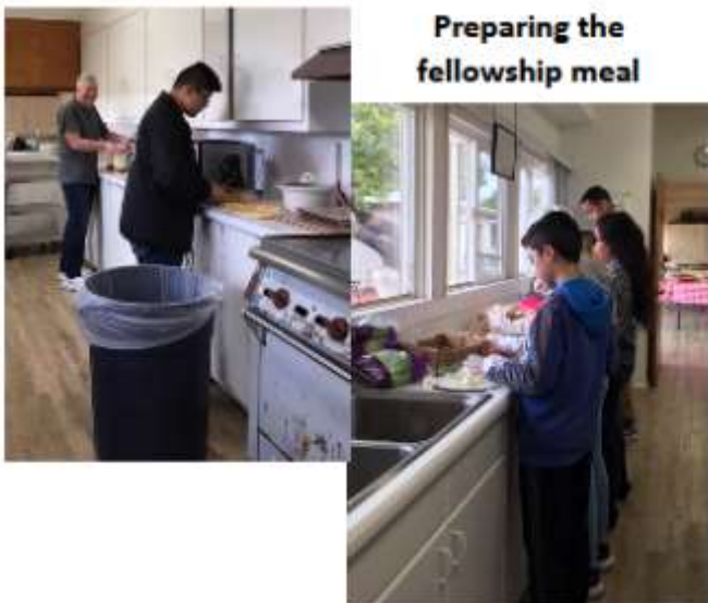
Preparing the fellowship meal