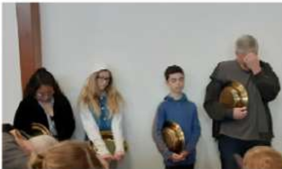
Praying prior to the offering collection