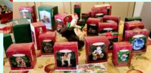
Ornament and décor fundraiser